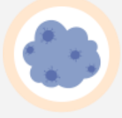
AIR BY COUGH OR SNEEZE