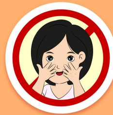
AVOID touching your face with your hands