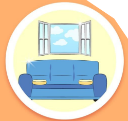
Keep your home and surroundings clean and well-ventilated