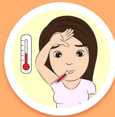
Monitor your temperature twice daily