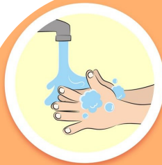
Wash your hands frequently with soap